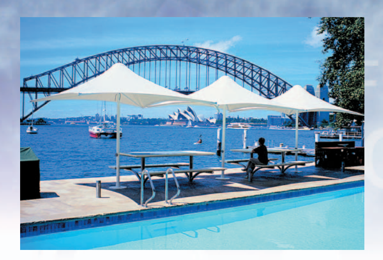
Please Note: Portables are wind rated to 60 mph Fabric used on portables is GL 1000 Fabric used on all other umbrellas is Ferrari 502S